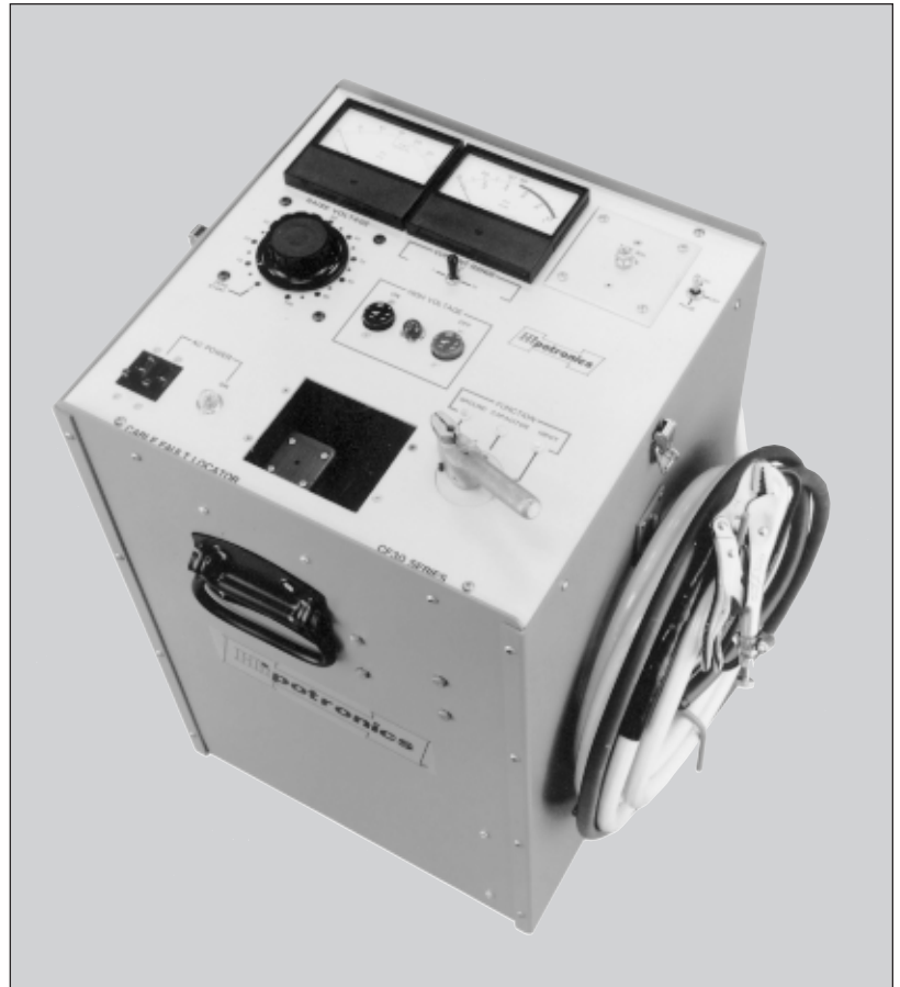
Model CF30 Cable Fault Locator